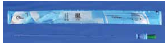
The Cure Ultra for men is a 16", pre-lubricated catheter with polished eyelets on a straight or coude tip, a unique, 'No Roll' funnel end, and proprietary CoverAll™ lubricant application process. Not made with DEHP, BPA, or natural rubber latex.

2. Inspect catheter before use. If the catheter or package are damaged do not use.